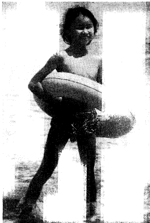
1968. Ха у Черного моря.